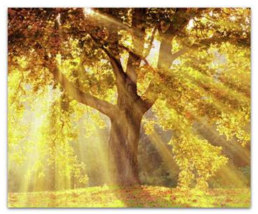
THE HEART CENTER: THE SUN

If we have been properly raised to have a healthy body and attitude toward life on Earth: Chakra #1 CHECK